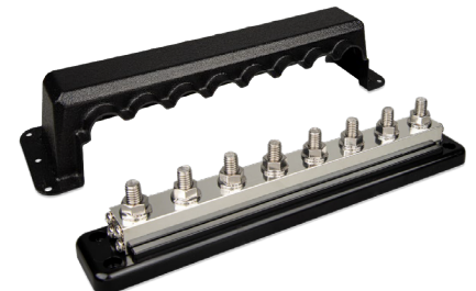
Busbar 600A 8P + cover VBB160080010