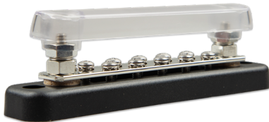
Busbar 150A 2P w/ 10 screws + cover VBB115021020