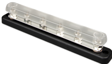
Busbar 150A 6P + cover VBB115060020