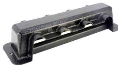
Busbar 250A 2P w/ 6 screws + cover VBB125020620