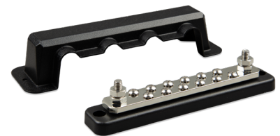
Busbar 250A 2P w/ 12 screws + cover VBB125021220