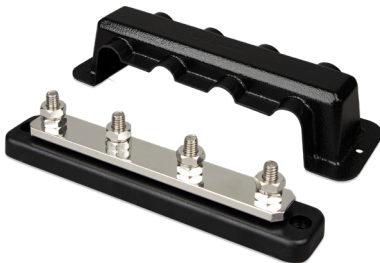
Busbar 250A 4P + cover VBB125040010